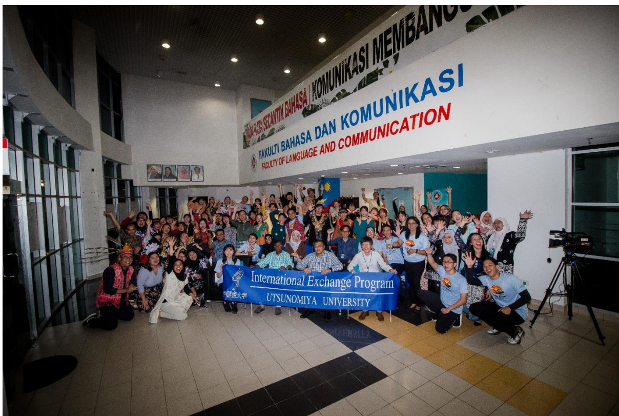
The EduTour2023 concluded successfully on 8 March 2023 after a two-week exchange program hosted by the Faculty of Language and Communication, UNIMAS.